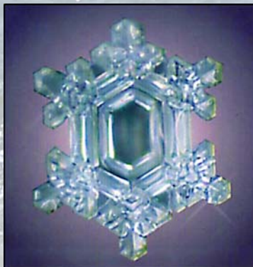
Roxtract Water Molecule Crystal

After decades of research that had sent him too many continents of the world, in search of the best rocks that contained most abundant minerals, he found them. In his own backyard! The rest is history and thanks to his work, we have become the beneficiaries of his discovery. He invented and patented a way to extract minerals from those rocks called black MICA and maintain them in an ionized form. Eventually he became the authority on the treatment and cleaning of water in Japan. This extraordinary discovery has led not only to the betterment of human health, but to revolutions in such industries as agriculture, poultry, horticulture, aquatics, raw sewage treatment, and waste water treatment. As a result, major conglomerates now use his lab as the final resource for their respective water treatment. Sony, Toyota, Hitachi, Matsushita and many other big companies known throughout the world use Roxtract today!